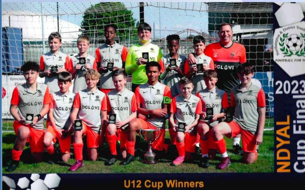
U12 Cup Winners