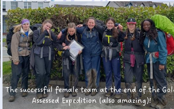
The successful female team at the end of the Gold Assessed Expedition (also amazing)!