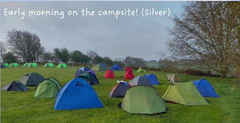
Early morning on the campsite! (Silver)