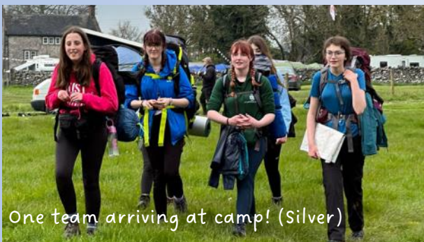
One team arriving at camp! (Silver)