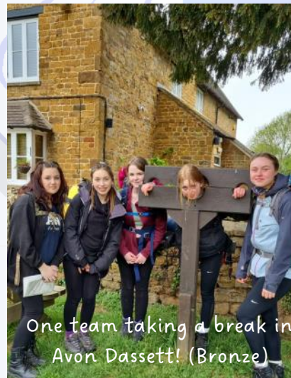
One team taking a break in Avon Dassett! (Bronze)

We were immensely proud of our students and how they dealt with these challenges.